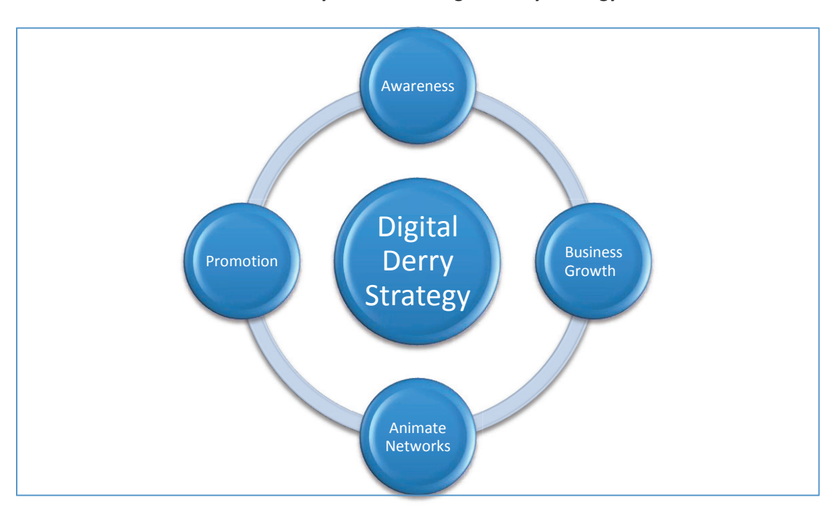
The 4 Key Aims of the Digital Derry Strategy

The wider objectives for the Digital Derry Strategy are that it should