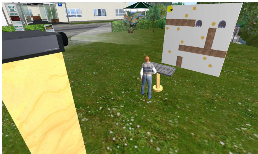
Fig. 4. An avatar playing a variant of game classic Pac-Man within Second Life available at coordinates http://slurl.com/secondlife/Leiplow/176/136/33