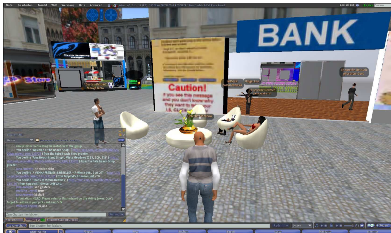
Fig. 2. Second Life in user view