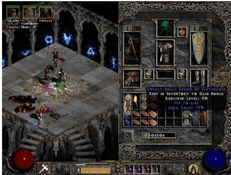
Fig. 1. Diablo II: 3 players are earning items after a fight, storing them in the players inventory.